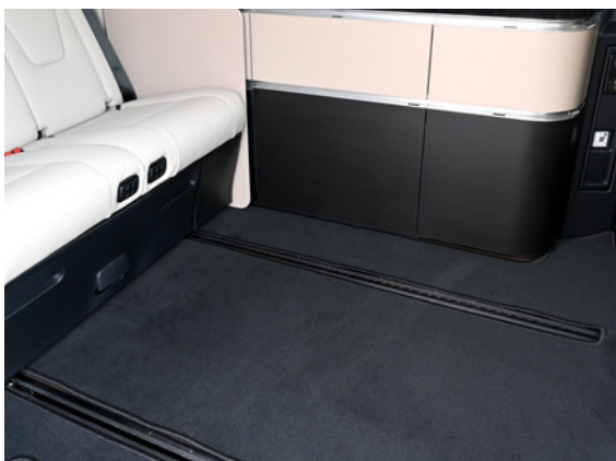
Elegant carpet for passenger compartment Carpet for 2 ground rails

Note: This way you create additional storage space or space for the toilet. Also suitable as a seat when the vehicle is parked. Attachment to the ground rail.