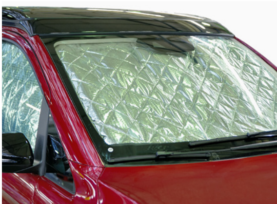
Isothermal set for driver's cab

Isothermal set for driver's cab: The three-piece insulating mat set also protects against intense sunlight and thus ensures pleasant temperatures inside the vehicle. Installation is easier than ever, thanks to sewn-in magnets on the side parts and tension rods on the front part. Insulating tent: The insulating tent consists of two 2 wedge-shaped side parts, a high front part and a flat rear part. These four parts are fastened to the roof liner from inside the pop-up roof using Tenax fasteners.