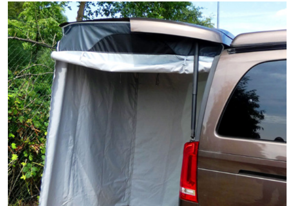
Tailgate privacy screen (close-up)

Note: The privacy screen can be attached to the tailgate with Velcro straps and can be fixed to the ground with pegs.