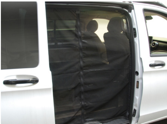
Mosquito net for sliding door

These mosquito nets protect you from even the smallest mosquitoes and are equipped with a zipper in the middle for easy entry and exit. In addition, they have a glare-free view. The material is flame retardant. The mosquito nets can be easily attached with the help of press buttons.