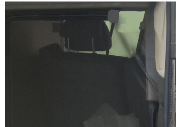
Mosquito net for tailgate (close-up)

Code Initial equipment: 288040248042 Code Shipping accessories: 288040248043 Weight: approx. 1 kg