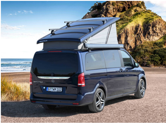
Thule roof rack

Motorhomes should always be an optimal combination of volume and vehicle length. Particularly in the case of compact vans, the question arises of where to put bulky items such as sports equipment or roof boxes. Because we at Westfalia have been working with this class for almost 60 years, needless to say, we also have the accessories to overcome these challenges. Whether it is a short trip or an extensive discovery tour, Westfalia offers roof racks that provide additional storage space and are ready for anything.