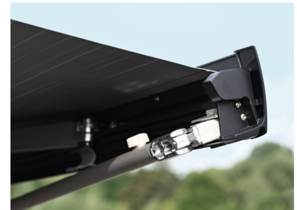
The telescopic support feet are very easy to fold out.

Note: You can prevent the awning fabric from unfurling with this tensioning set. In extreme wind, we recommend retracting the awning. Scope of delivery: 2 tensioning straps (2-part), 2 ground spikes, 2 tension springs and stowage bags