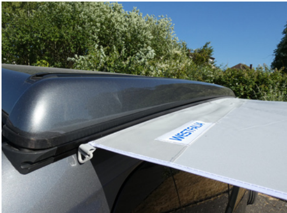
Sun shade sail Westfalia Flexo (see image on the right)

Sun shade sail Westfalia Flexo: A sun shade sail that can be used flexibly. The cut and features allow for a variable depth, thus making the sun shade sail ideal for travel and for use on a wide variety of plot sizes. Sun protection can be optimised by lowering the tip of the sun shade sail. Quick and easy to set up, the sun shade sail attaches to the vehicle via the retractable piping. Tailgate privacy screen: The privacy screen, which can be installed quickly and is equipped with two zippers, offers you the extension of the living area. It protects you from unwanted glances and sunlight. Ideal for using the outdoor shower and toilet.