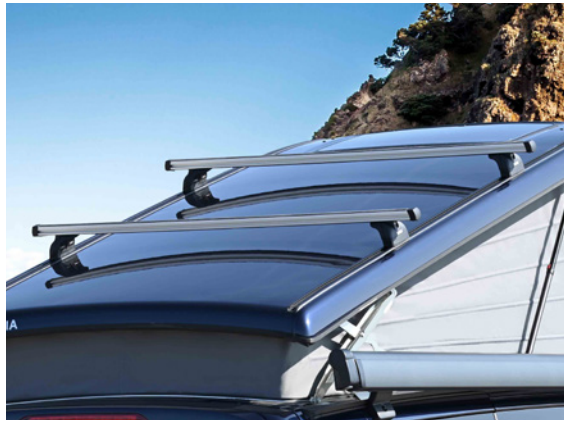
Thule roof rack (close-up)