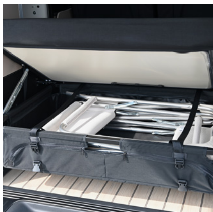
Stowage bag for camping chairs

Code Shipping accessories: 288040248058 Weight: approx. 3 kg