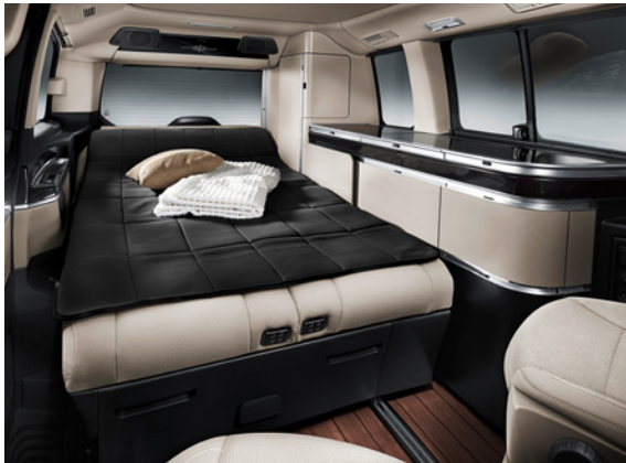
Airmesh mattress topper for Marco Polo

The innovative sleep system with 3D Airmesh technology! Sleep like you're resting on an air cushion. The mattress topper combines optimal sleeping climate and sleeping comfort with the best hygiene and the smallest pack size. Climate-regulating! Made of 4-component highly breathable 3D Airmesh. No heat and moisture accumulation due to air circulation/ ventilation effect. Hygienic! Guaranteed to be anti-allergic, free of harmful substances, mite and mould-resistant. Particularly easy to clean by spraying with water. Fast-drying. Completely washable at 40 °C in the machine / dry cleanable. Comfortable! Air cushion surrounded by thousands of flexible springy microfibres. Evens out unevenness in a permanently elastic manner with high restoring force.