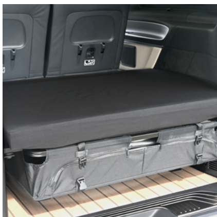
Protective cover for rear upholstery Marco Polo

Cover made of washable and durable textile which protects the bed extension from dirt.