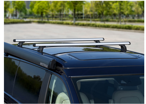
Thule roof rack (close-up)