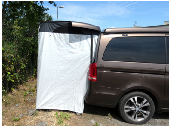
Tailgate privacy screen

Note: Scope of delivery: Sun shade sail, pitching poles, guy ropes, ground spikes, packsack; Material: Trailtex fabric, polyester fabric PU-coated