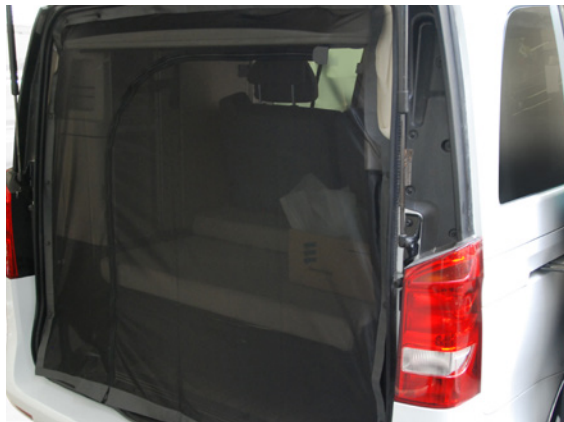
Mosquito net for tailgate

Code Initial equipment: 288040248040 Code Shipping accessories: 288040248041 Weight: approx. 1 kg