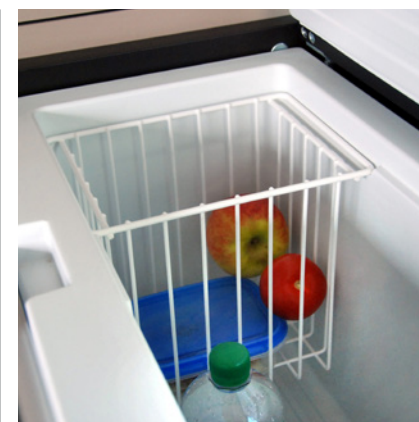
Hanging basket for cooler

Code Shipping accessories: 288040248010 Weight: approx. 0.5 kg