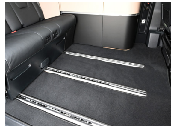
Elegant carpet for passenger compartment Carpet for 3 ground rails

Note: The elegant velour carpet is very resilient and water resistant - thanks to PU coating. The carpet is tailored for the living area of your vehicle.