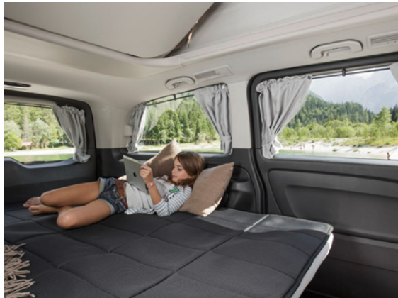
Airmesh mattress topper for Marco Polo HORIZON / ACTIVITY

Code Shipping accessories: 500095 Weight: approx. 5 kg Dimensions: 200 x 108 x 2cm