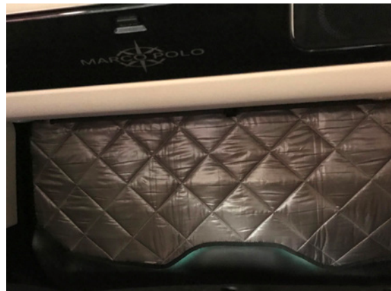
Isothermal set for tailgate for big-flip windows

Note: Material: 7-layer sandwich textile with fibre-reinforced, reflective Mylar exterior film and hydrophobic fabric inner side