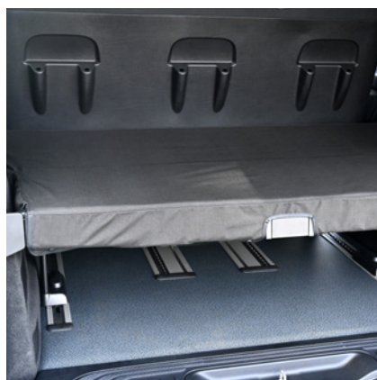
Protective cover for rear upholstery Marco Polo HORIZON / ACTIVITY

Note: The material used is incredibly abrasion-resistant and robust due to the strength of the fibres consisting of polyamide and its manufacturing process. The product is quick-drying and has a water-, oil- and dirt-repellent finish, so that moisture rolls off.