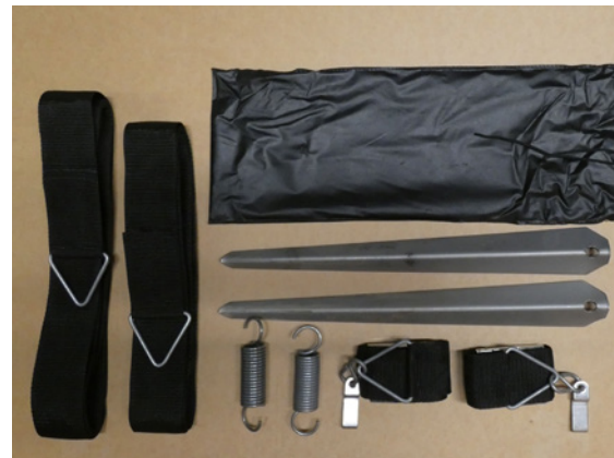
Lashing strap set for awning

Code Silver: 288042248030 (Shipping accessories) Code Anthracite: 288042248031 (Shipping accessories) Length: 2.60 m Pullout: 2.00 m Housing: optionally anodised in silver or anthracite Weight: approx. 22.00 kg (incl. separate Assembly kit 288040248022)