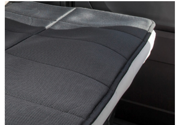
Foldable! Ultra-light handling and space-saving storage on rear cushion.

Code Shipping accessories: 500096 Weight: approx. 5 kg Dimensions: 192 x 129 x 2cm